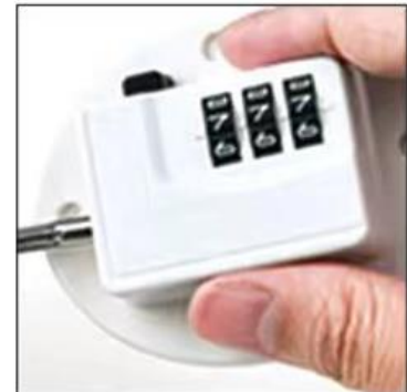
6) The lock is now ready to be used with your personal code