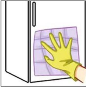
1) Clean the surface