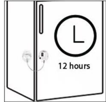
3) Wait 12 hours for the glue to stick