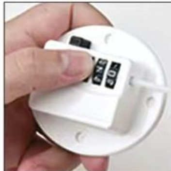
5) Use a small, sharp object to point into the reset button hole and hold it until you have changed the password