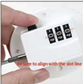
4) Set the digits to 000 and press the button to open the lock